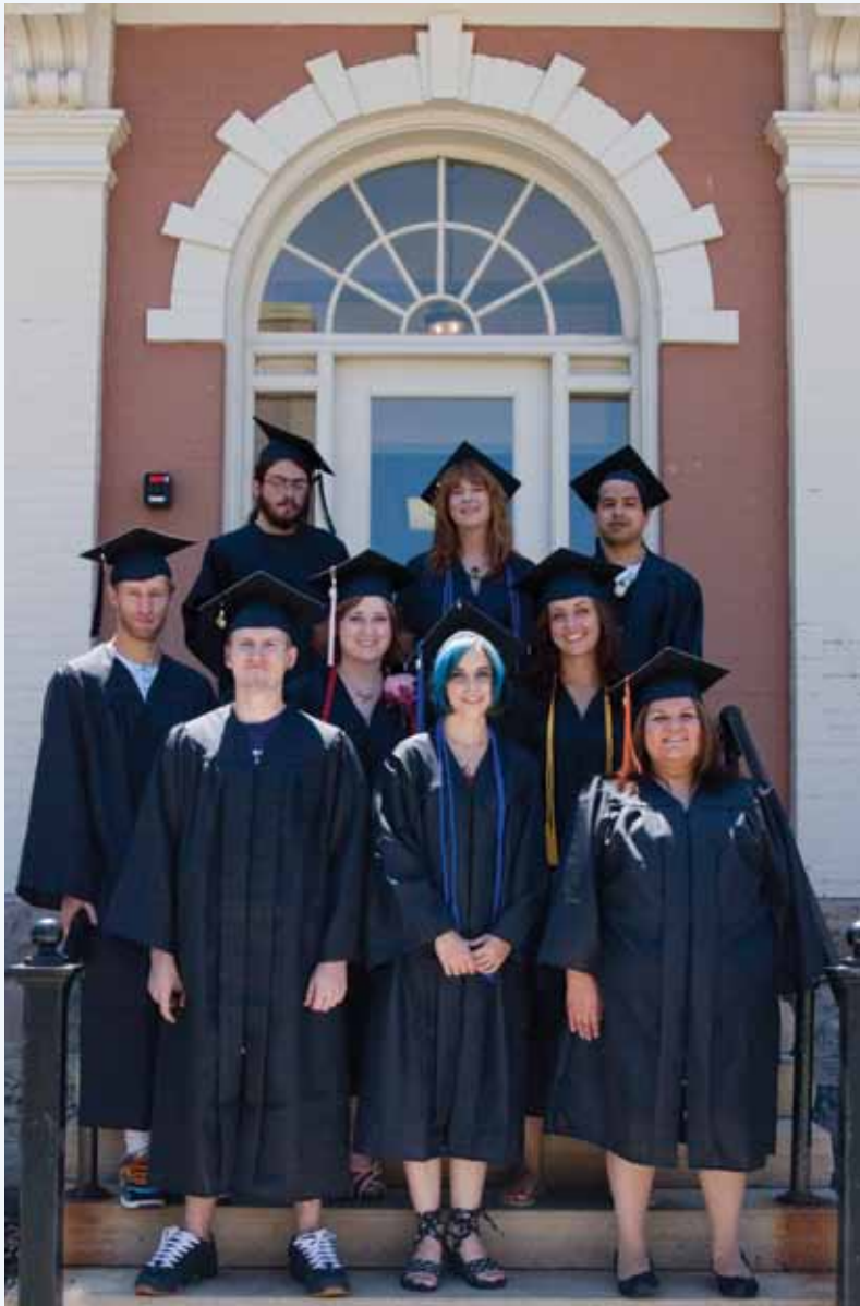
Graduates before ceremony in front of Rotunda Building