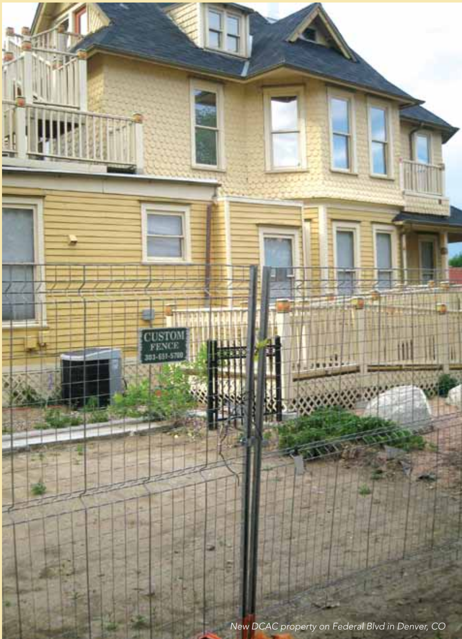
New DCAC property on Federal Blvd in Denver, CO