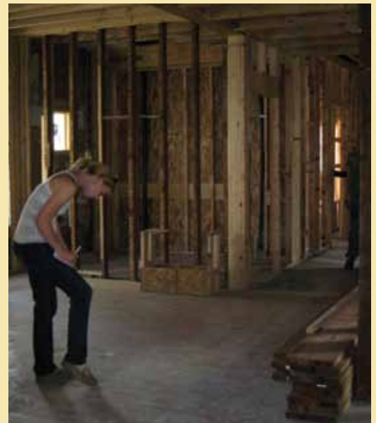
Interior Design Students working on project